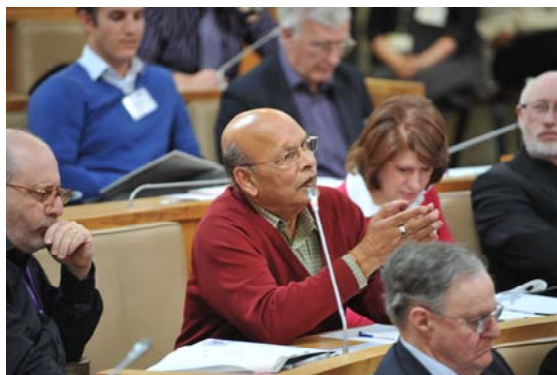
Harrow scrutiny councillors participate in the discussions

In March we hosted the launch of the Centre for Public Scrutiny's (CfPS) guidance on Councillor Calls for Action. Nearly 100 representatives of scrutiny committees in the London/South East England area attended the launch and participated in the associated workshops, designed to help all of us ensure the most effective implementation of this challenging piece of legislation.