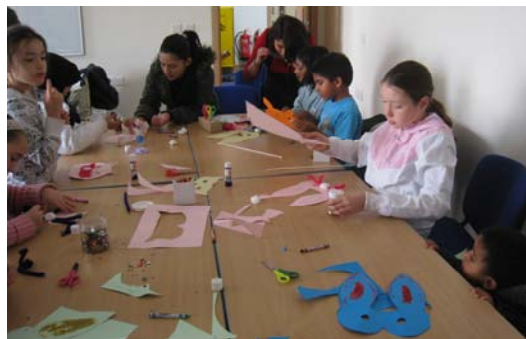
Extended schools in Harrow