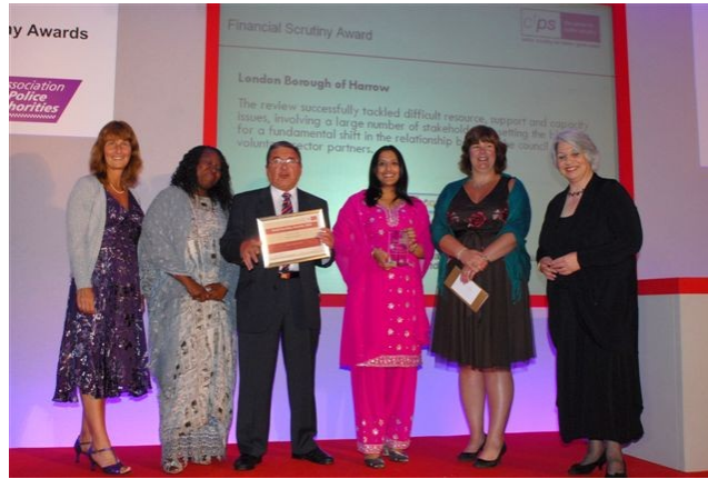
Members of the review team pick up the CfPS award from a CIPFA judge and CfPS Honorary President

Very recently we were delighted to receive the good news that we had won a national Centre for Public Scrutiny 'Good Scrutiny' award. We were shortlisted for the award for our review, 'Delivering a Strengthened Voluntary and Community Sector for Harrow' alongside colleagues from Westminster and Staffordshire Councils.