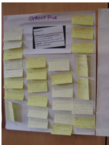
Consultation with the sector was a key part of the project