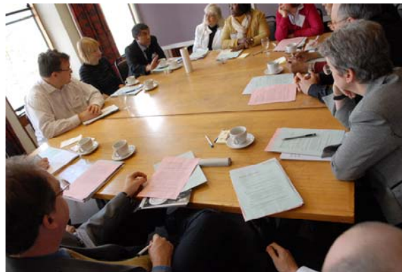
Councillor calls for action could mean quite a change for Overview and Scrutiny

We are very grateful to all of the officers who have provided us with the information upon which to base our investigations.